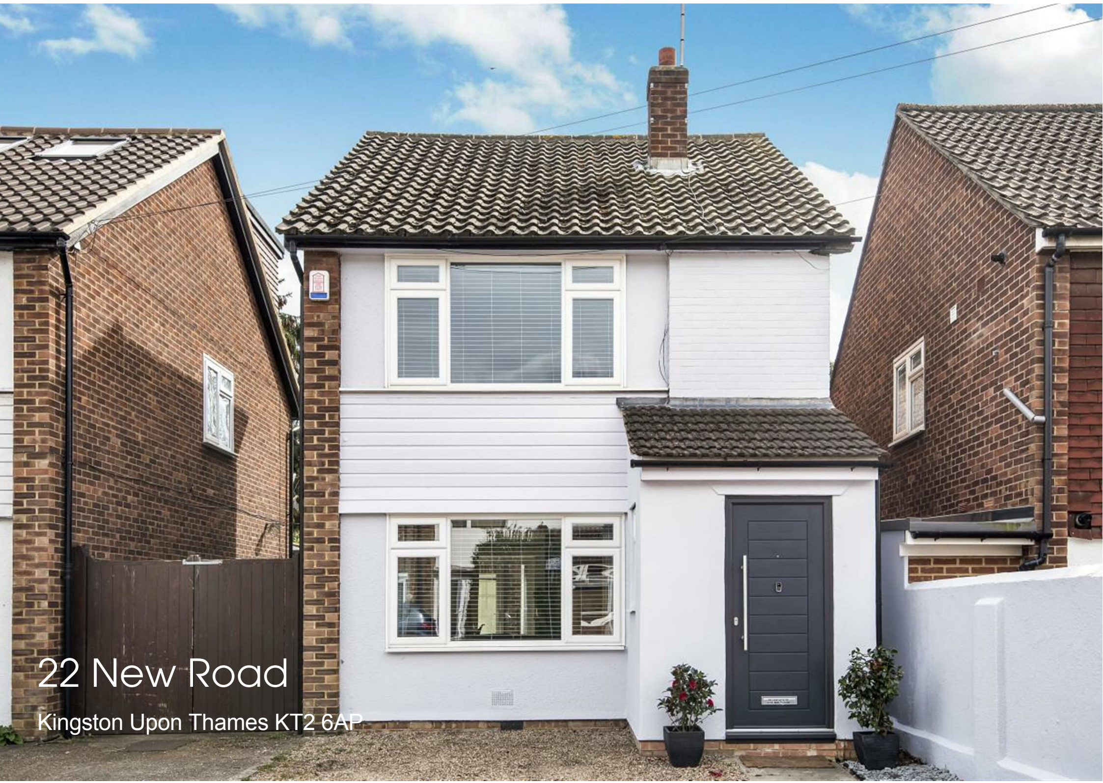
22 New Road Kingston Upon Thames KT2 6AP